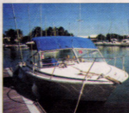
Ian Batchelor's 28ft. Bertram After You

Batchelor adds: "We normally leave in the early morning and fish until about 4. We then motor back to our destination be it land or a yacht. Most of our outings depend on the tide. The best time for fishing is on the rising or falling tide - only once a day in our latitude. We take two people per flat boat so if we have a single fisherperson we try to match them with someone else. No bait is used because all fly fishing is artificial. The hook is made out of silk, feather, synthetic hair etc. to get the color and shape. At night we sometimes fish for tarpon on a full moon. The search here is equally as important as the skills. Once the proper flats are found we then fish that